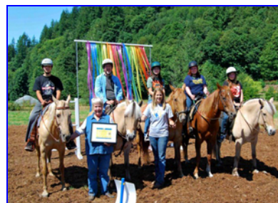
Video Crew Accepts BH Thanks

Thanks again to Toledo High School for this great gift.